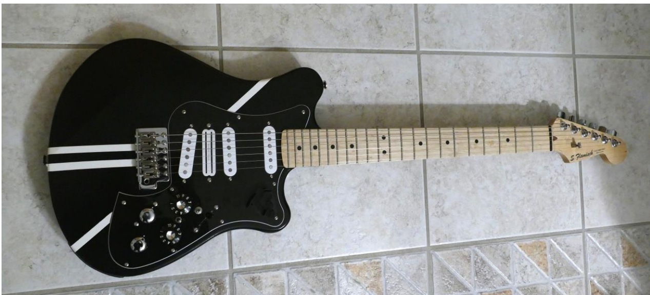
Sigi Flamisch, November 2017